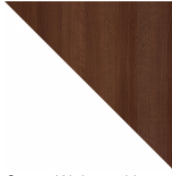
Opera Walnut with White Contrast