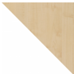
Maple with White Contrast