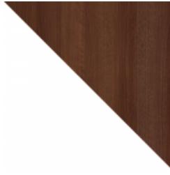
Opera Walnut with White Contrast