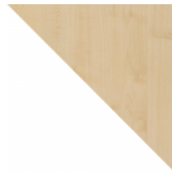
Maple with White Contrast